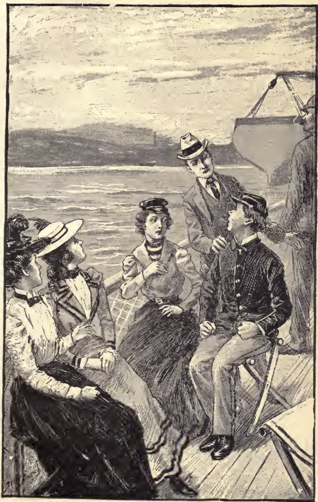
"AN UNPLEASANT MEETING ON THE LAKE."